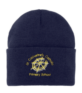
St Catherine's Winter Hat Optional Headwear £5.95