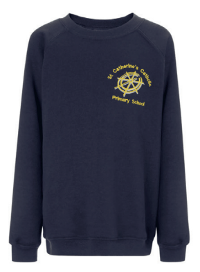
St Catherine's Sweatshirt From £14.95