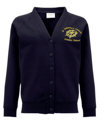
St Catherine's Cardigan From £15.95