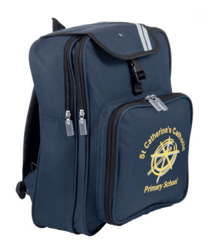
St Catherine's Backpack With Pencil Case £14.95