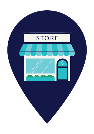
Monday to Friday 09:00-17:30 Saturday 09:00-17:00 Closed Sunday.