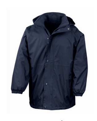
Navy StormDri Jacket Waterproof From £26.00