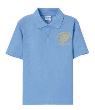
St Catherine's Polo Shirt From £9.95