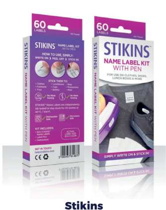
Write On, Peel Off, Stick In!