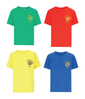
St Catherine's PE T-Shirt 100% Cotton From £7.50