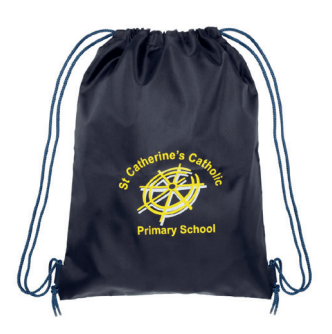
St Catherine's PE Bag Drawstring Bag £7.50