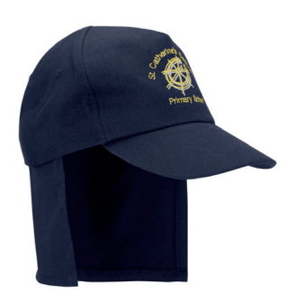
St Catherine's Legionnaire's Cap Optional Headwear £6.95