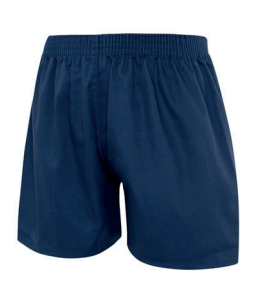
Navy Cotton Shorts Plain Navy From £6.50