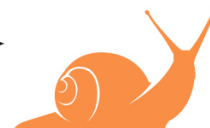
garden snail primary consumer