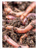
Worms are decomposers and prey. They eat dead plants and animals. They are eaten by birds and some small mammals, such as shrews.