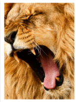
Lions are apex predators. They eat large mammals, such as zebras and young elephants.

A predator is an animal that hunts, kills and eats other animals. An apex predator is at the top of a food chain and isn't hunted by any other animal. The animals that predators hunt and kill for food are called prey. A decomposer eats dead plants and animals, releasing nutrients into the soil for plants to take in through their roots. Some bacteria, fungi, insects and worms are decomposers.