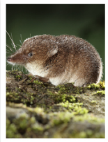
Shrews are both predators and prey. They eat insects and worms and are eaten by birds of prey and some mammals, such as foxes.