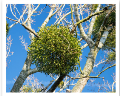
mistletoe growing in a ball on a tree

Some plants are also parasites because they get nutrients from other plants. Mistletoe grows in branches of trees. It inserts part of its root through its host's bark to get water and minerals. Eyebright is a small flowering plant that gets some of its nutrients from the roots of grasses that grow nearby.