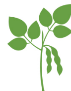
bean plant producer

Food provides energy for all living things. Energy is needed for life processes, including breathing, growth and movement. Food chains show how energy passes from one plant or animal to another. Most plants make their own food. They are called producers. Animals that eat other plants or animals are called consumers.