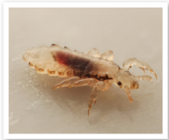
magnified head louse

Head lice are ectoparasites that live on the human scalp. They get nutrients by biting through the skin and drinking human blood. Head lice make the head feel itchy. Tapeworms are endoparasites that live in the human gut. They attach onto the inside of the gut wall and absorb nutrients from the food a person eats. This can cause pain, diarrhoea, vomiting or tiredness for the person.