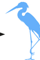
grey heron tertiary consumer