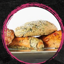
FRESHLY BAKED BREAD