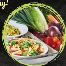
NEW TASTES AND TEXTURES WITH A TRIP TO THE SALAD BAR