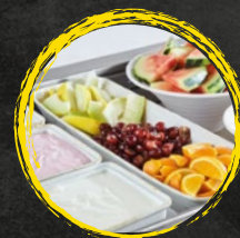
A DELICIOUS DESSERT