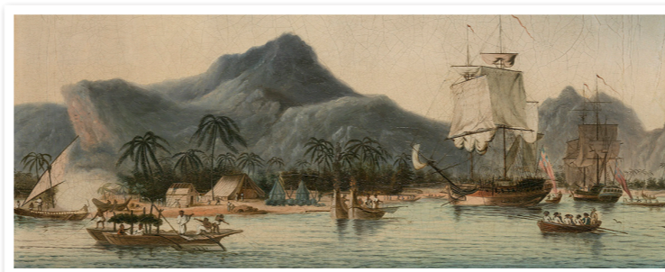
Resolution and Discovery in the Pacific Ocean

In 1776, Captain Cook went on his final voyage. He sailed on the Resolution again and the Discovery travelled with him. He was looking for a route between the Atlantic and Pacific Oceans. He visited the Hawaiian Islands, where he was killed.